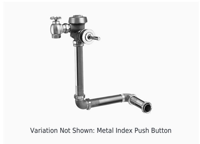
Variation Not Shown: Metal Index Push Button